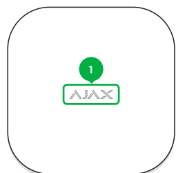
1 - Logo with a light indicator